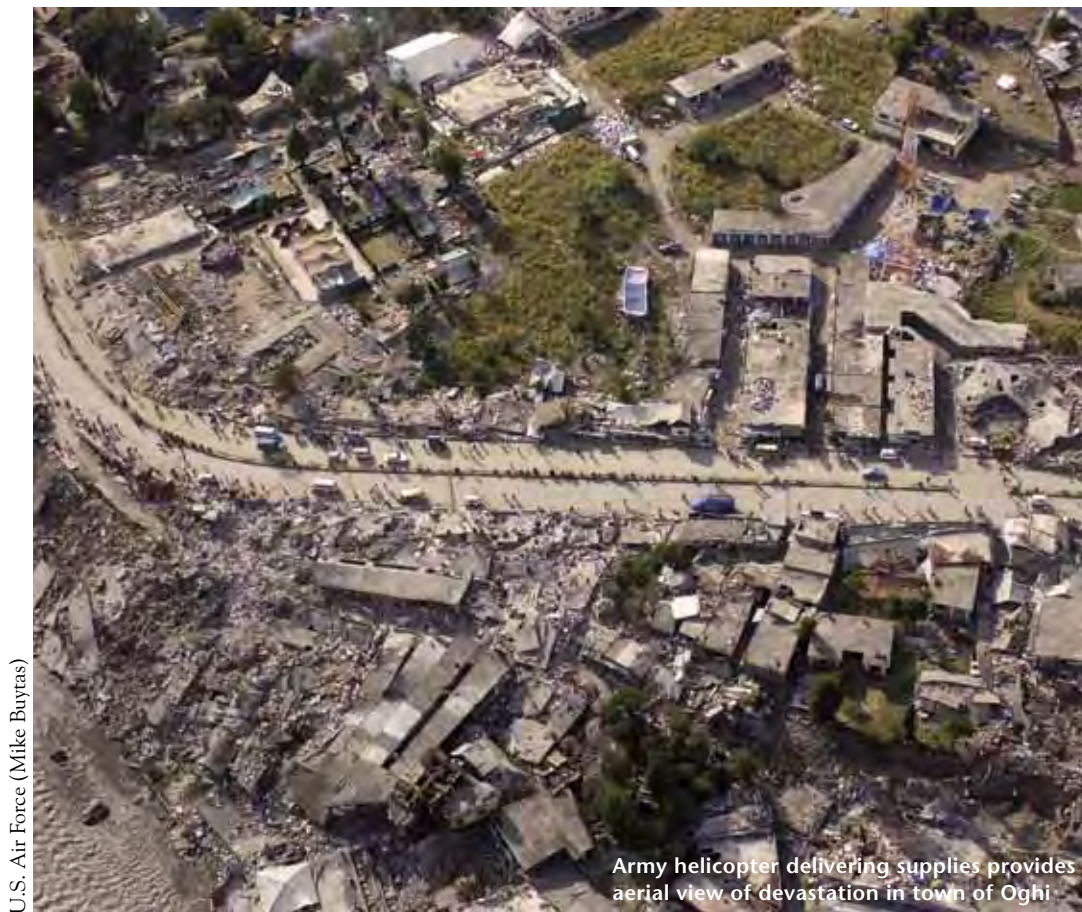
U.S. Air Force (Mike Buytas)