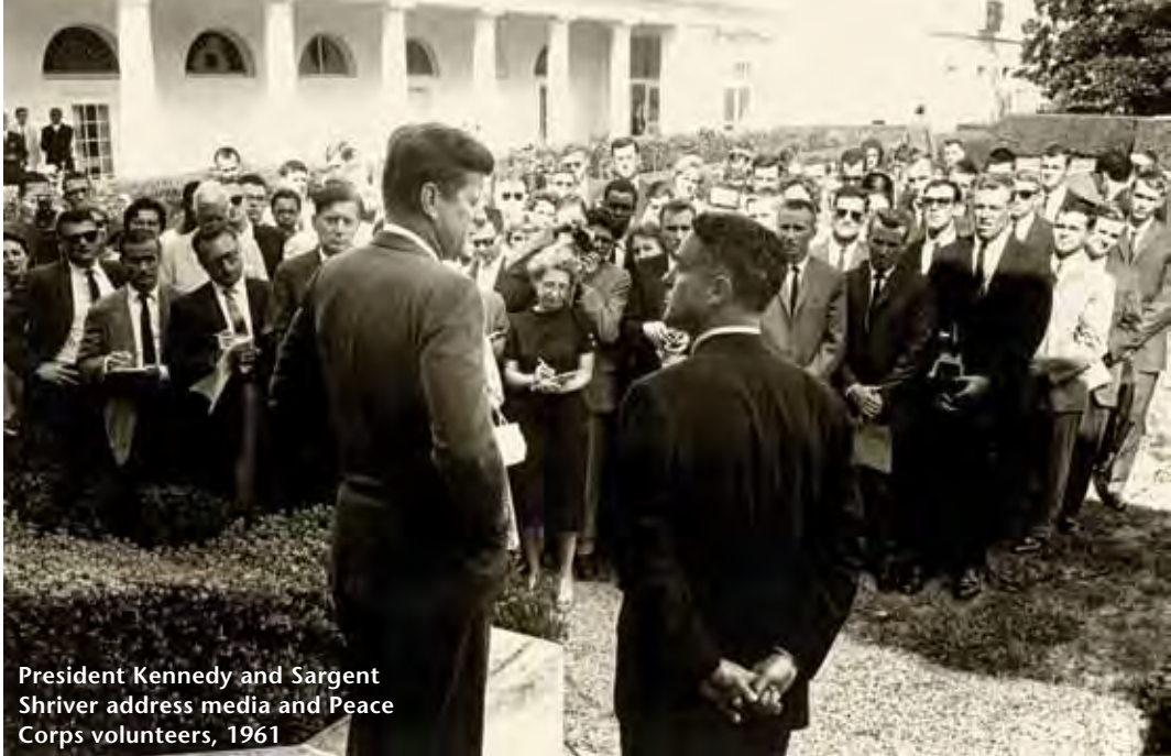
President Kennedy and Sargent Shriver address media and Peace Corps volunteers, 1961