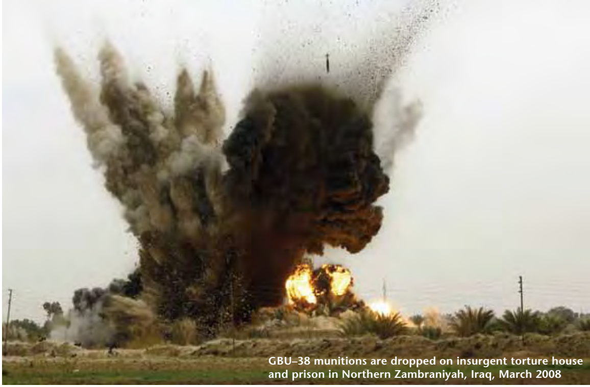
GBU-38 munitions are dropped on insurgent torture house and prison in Northern Zambraniyah, Iraq, March 2008