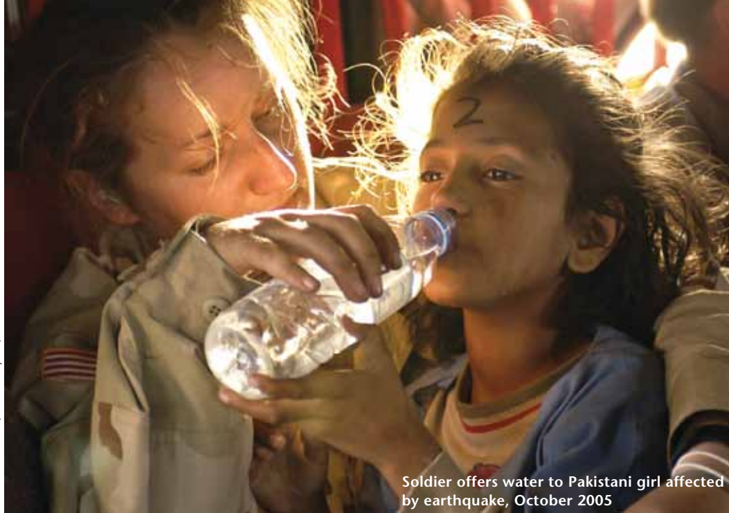
Soldier offers water to Pakistani girl affected by earthquake, October 2005