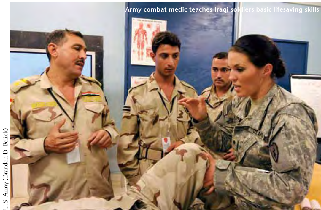
U.S. Army (Brandon D. Bolteck)

moment in U.S. national security policy defined by the influence of soft power in doctrinal and strategic planning. 10 We describe, for instance, the changing nature of operational environments through the eyes of this document; the civilian tasks deemed necessary in new conflict environments; the changing role of the military and its new areas of responsibilities; and emergent practices in the evolution of postconflict reconstruction military paradigms. At the core, we see a major departure from 9/11-era security strategy (in NSS 2002 and NSS 2006, among other documents) in this manual as a function of perspective—a whole-of-government approach informed by both a war-based and a postconflict vantage point. 11 We also see, as a product of this changed perspective, an increasing convergence of mission in U.S. national and international security policy objectives and in interventions more broadly, evident in the 2010 NSS. Most significantly, we frame Stability Operations as a document pervaded by a self-reflective process in which a military institution, in this case the U.S. Army, is in the act of reimagining itself to play a different role in international security and, consequently, adapting to a transforming identity.