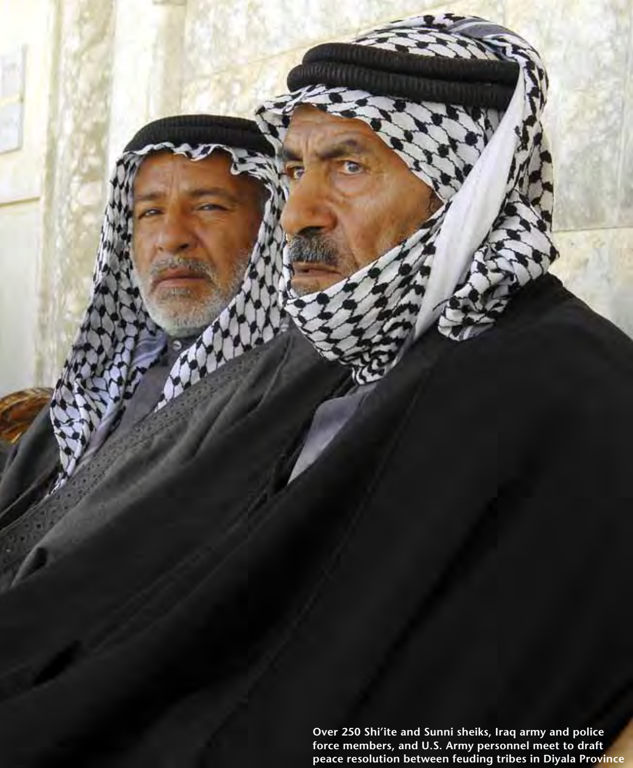
Over 250 Shi'ite and Sunni sheiks, Iraq army and police force members, and U.S. Army personnel meet to draft peace resolution between feuding tribes in Diyala Province

came to Iraq in increasing numbers and were recruited not only by the former regime, but also by al Qaeda and other jihadist groups.